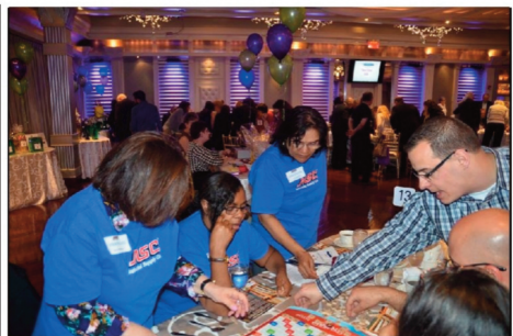
MSC Industrial Direct was present in force with 46 players!