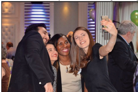
Getting ready for game play... (un)SCRABBLE judges selfie.