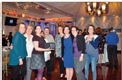
Tutor Team, Full House, did us proud by winning 2nd place. Way to go tutors!