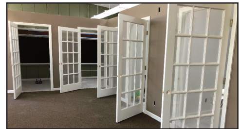
The tutoring center is almost done being painted, but is already being used 6 days a week by the 12 children in our program!

We are now in the thick of preparing for our grand opening celebration, and you will see invitations in your mailbox very soon. Until then, please hold the date in your calendar: Sunday, November 4th at 12pm, for a formal ribbon cutting followed by tours of the building, lunch, and a keynote speaker. Many of us will be coming that day straight from the Dyslexia Dash in Eisenhower Park (see page 4 for details). continued on p.2