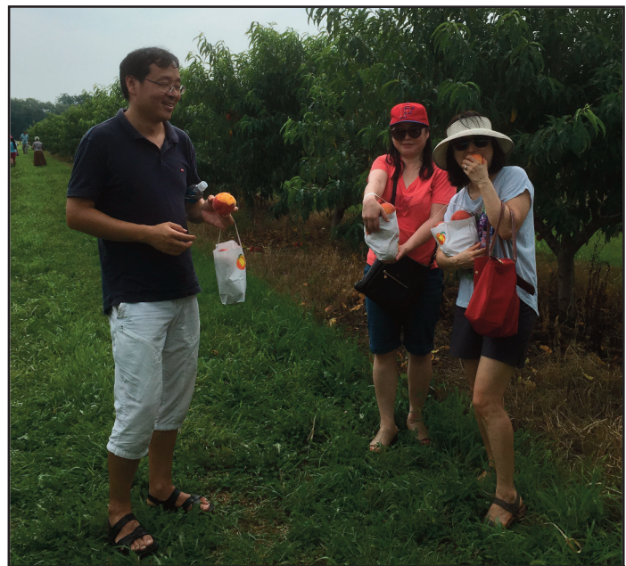
ONA students enjoying a day at Wickham's Farm.

http://www.wickhamsfruitfarm.com/pyo.htm