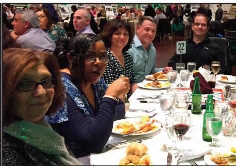
MSC staff members were all smiles over a delicious buffet dinner and great camaraderie.