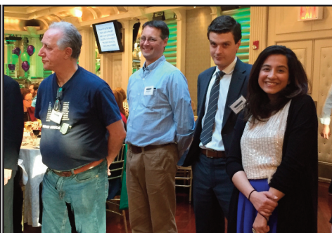
Umama poses with a handful of our judges before round 1 gets started.