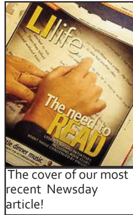
The cover of our most recent Newsday article!

of your hard work and dedication, and we hope that you will share in our excitement over this amazing article in Newsday. If you have not seen it yet, please contact me at (516) 867-3580, extension 21 and I will be sure to mail a copy to you.